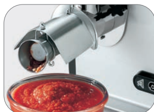
TC 12 DENVER

Passapomodoro opzionale Optional tomato sauce making