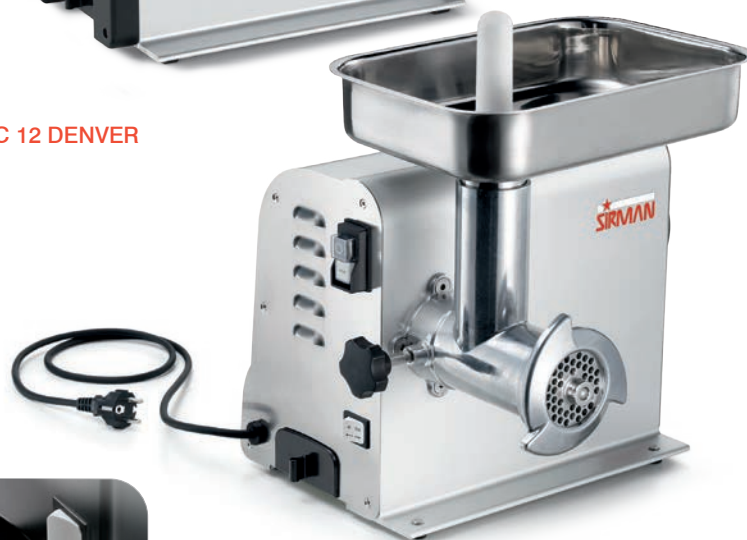
TC 12 DENVER FX