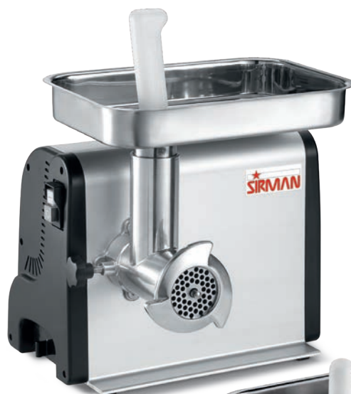
TC 12 DENVER